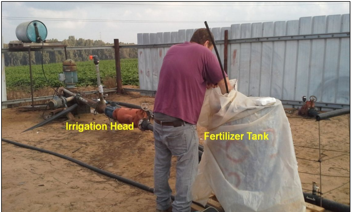
Addition of the Unleash™ Solution to the Fertilizer Tank