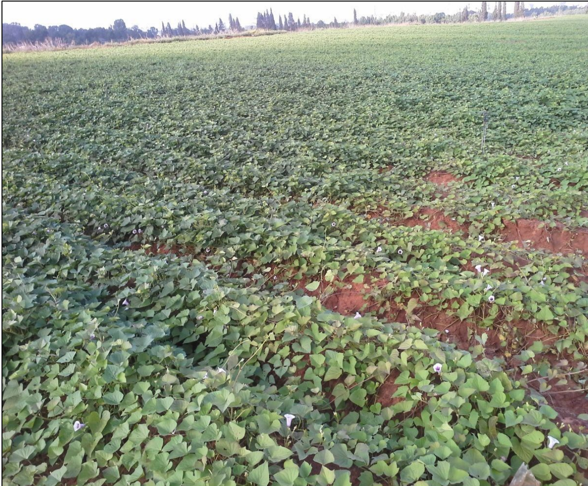
Mature Unleash™-Treated Sweet Potato Field